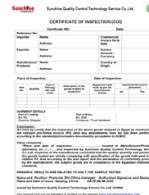
Inspection certificate sample

Sunchine Inspection recommends to the exporter to not to ship the cargo before issuance of the Certificate of Conformity.